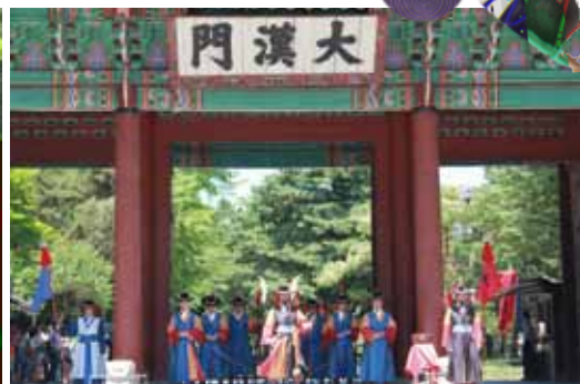
the Royal Place