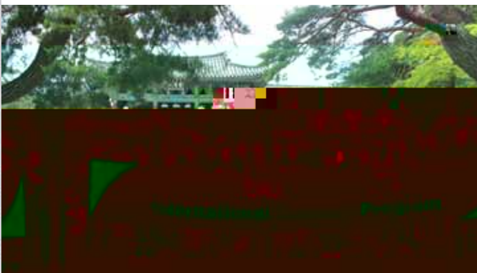
Field Trip to Gyeongju