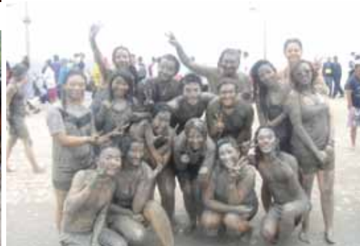
Boryeong Mud Festival