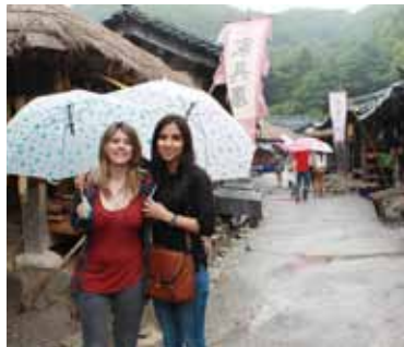
KOFIC Namyangju Studios