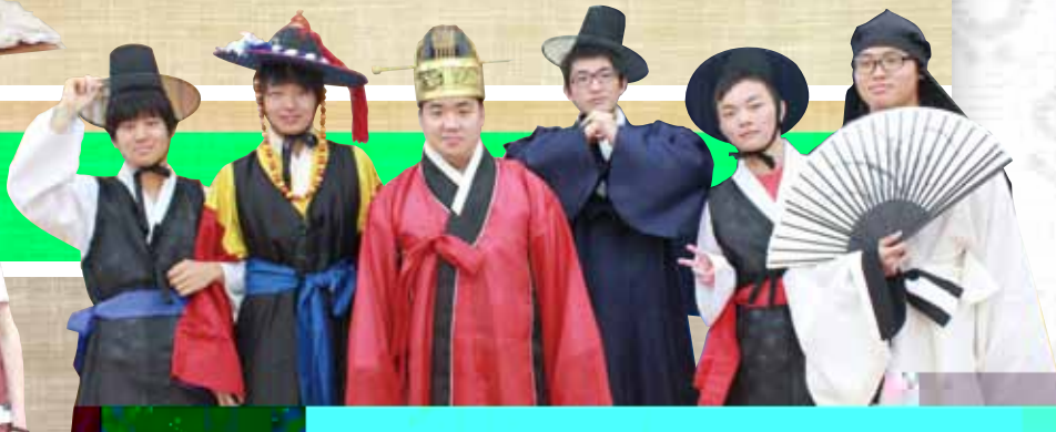
Hanbok (Traditional Korean Costume)