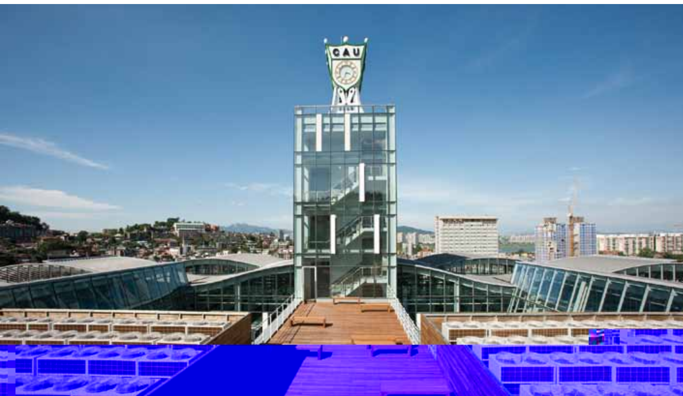
CAU Garden, Central Library

This Chung–Ang International Summer Program will contribute to that effort. In accordance with this vision, Chung–Ang University launched the CAU Summer program in 2005. Through this program, students will be introduced to various topics ranging from traditional Korean culture to contemporary Korean society. In addition, various excursions are scheduled for each week during the program. There will be field trips to the historical and cultural places, all of which are related to the lectures. The International Summer Program (ISP) at Chung–Ang University is an opportunity to spend an unforgettable summer in Korea.